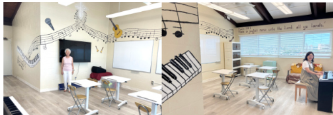
Hongo Music Center

Praise God for His perfect timing. None of this is for our glory, but for His. He was the One who first gave us the vision, who brought us into relationship with you, our faithful supporters, who led us to young people who have a passion to use their music for His Kingdom, and who will continue to use our humble efforts for His eternal glory.