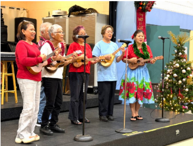
Ukulele group ministers at Christmas walkthrough