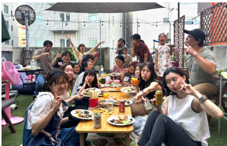
BBQ at The Neighborhood with our English students & families.