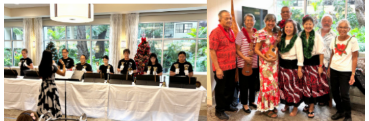
Christmas Concert at Arcadia with Adult Choir, Ukulele Group, Bell Choir and KUC Hula Ministry.