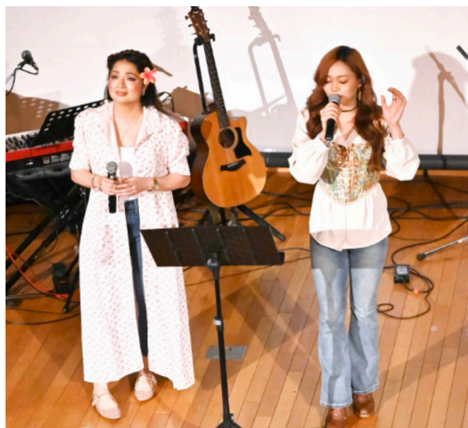
Special song at our church's Women's Conference.

1) I recently took on the role of Vocal Leader for our young adults worship team. It is both a joy and a