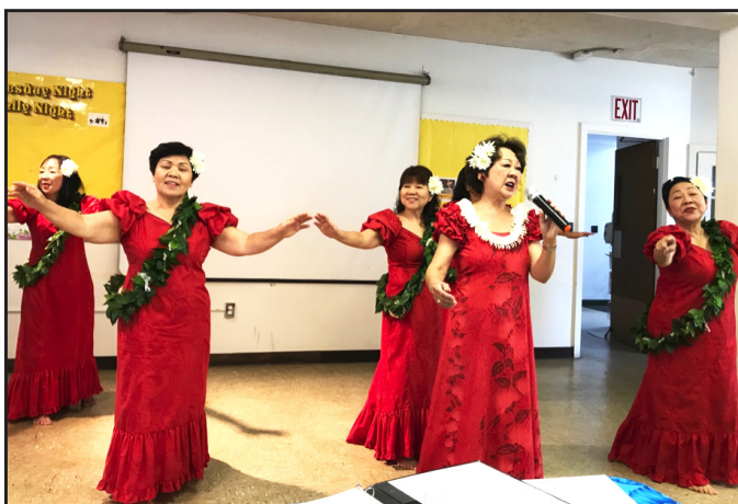
Master’s Touch hula ministry at the Pau Hana Valentine Luncheon.