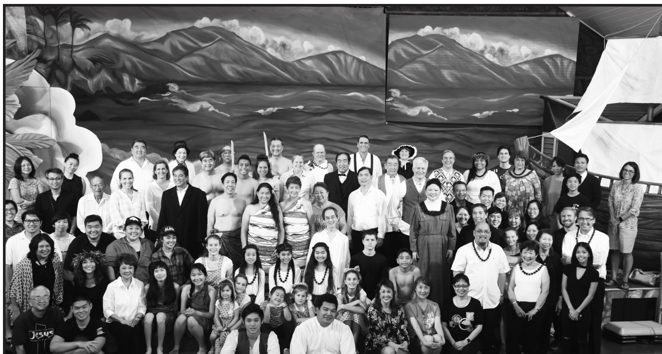
The cast and crew of Glory in His Soul.